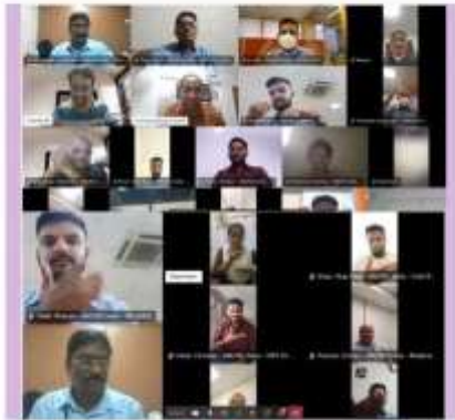
Sign Language workshop with AM/NS India